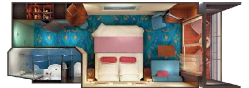
BB BALCONY Sleeps up to four.