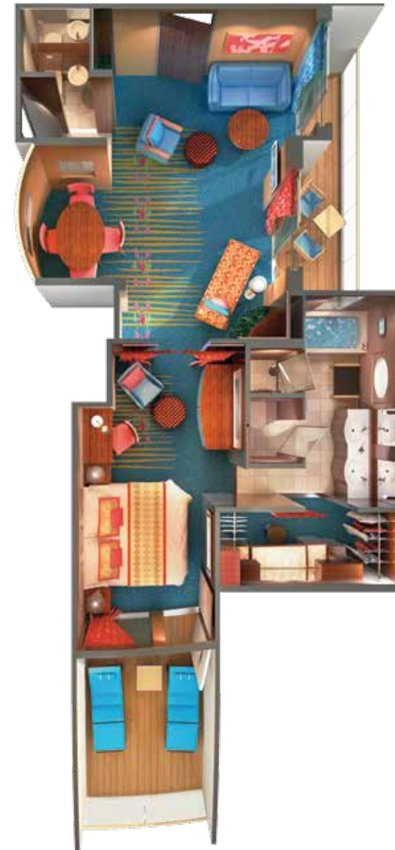
H3 THE HAVEN OWNER'S SUITE WITH LARGE BALCONY Sleeps up to four.