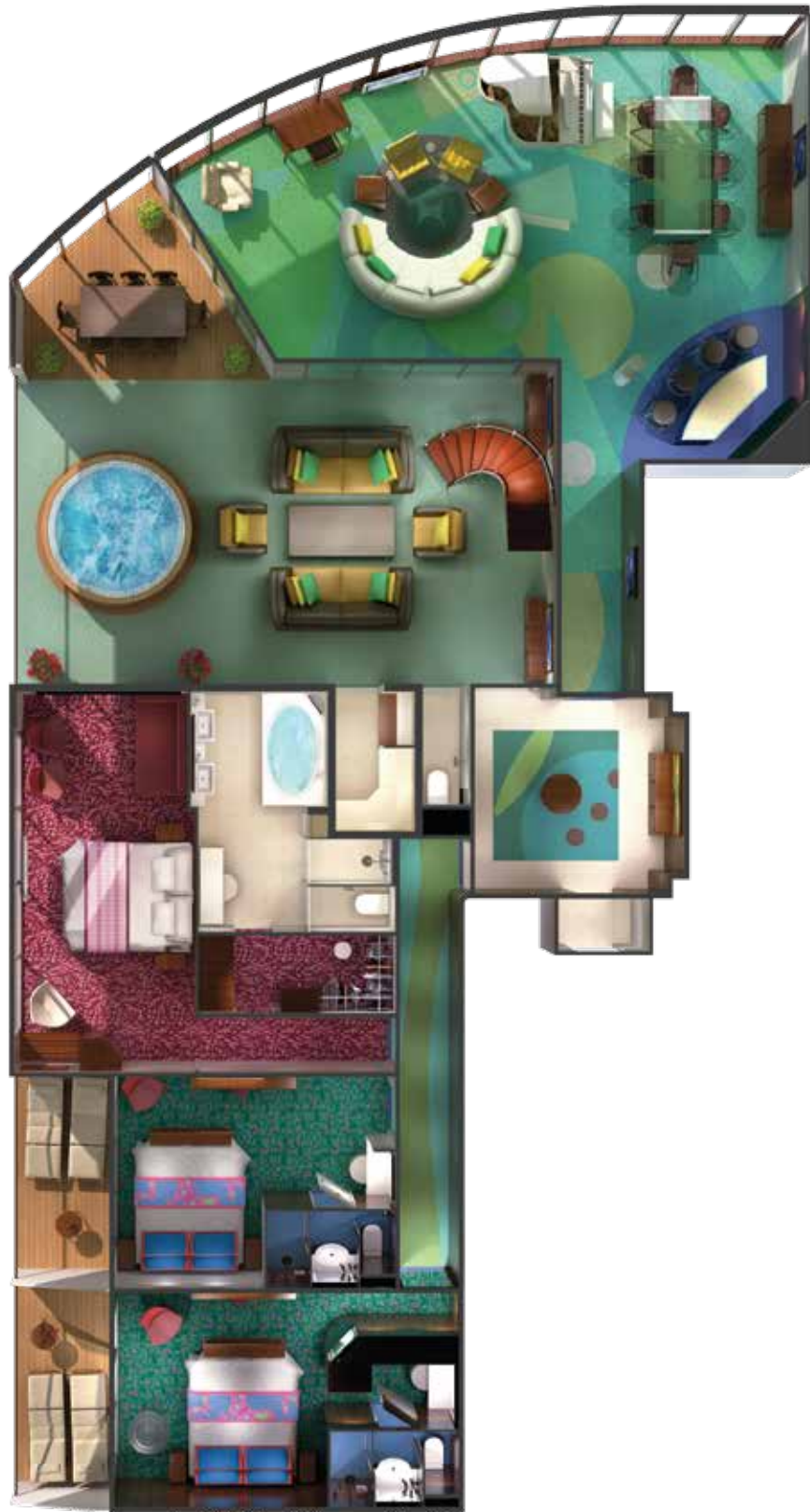
H1 THE HAVEN 3-BEDROOM GARDEN VILLA Sleeps up to eight.