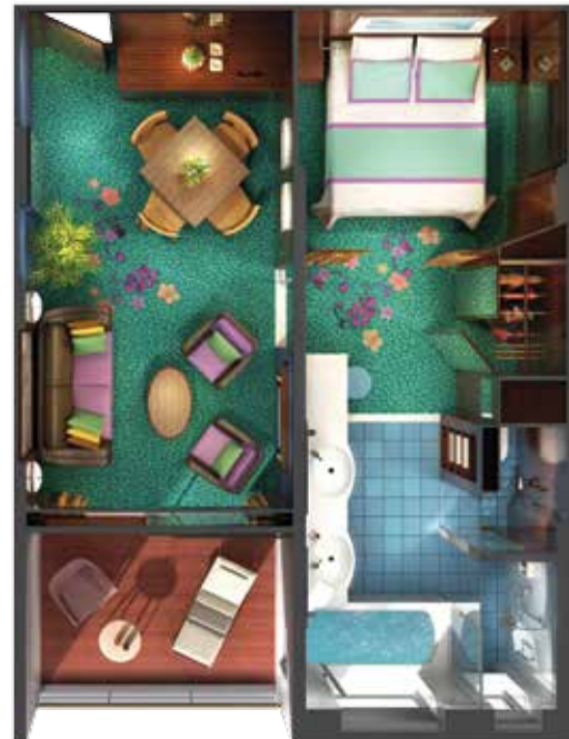
H5 THE HAVEN COURTYARD PENTHOUSE WITH BALCONY Sleeps up to three.