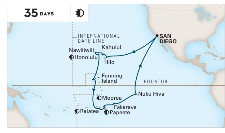
HAWAII, TAHITI & MARQUESAS

For the most up-to-date details and fares see hollandamerica.com.