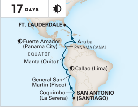
INCA & PANAMA CANAL DISCOVERY SAN ANTONIO (SANTIAGO) TO FT. LAUDERDALE Oosterdam 2024: Mar 19