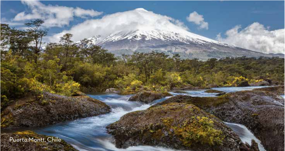
Puerto Montt, Chile

Change to arrangements may be subject to change charges.