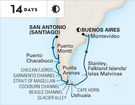
SOUTH AMERICA PASSAGE SAN ANTONIO (SANTIAGO) TO BUENOS AIRES Oosterdam 2023: Dec 2 2024: Feb 20