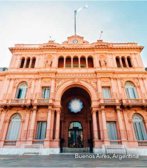
Buenos Aires, Argentina