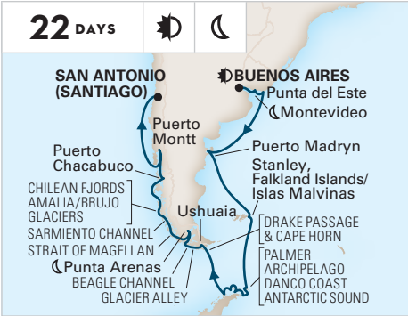
SOUTH AMERICA & ANTARCTICA ♦ BUENOS AIRES TO SAN ANTONIO (SANTIAGO) Oosterdam 2023: Dec 16 ★ 2024: Jan 29 ★ Celebrate the holidays on this sailing.