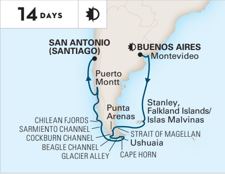
SOUTH AMERICA PASSAGE BUENOS AIRES TO SAN ANTONIO (SANTIAGO) Oosterdam 2024: Mar 5