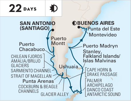
SOUTH AMERICA & ANTARCTICA ♦ SAN ANTONIO (SANTIAGO) TO BUENOS AIRES Oosterdam 2024: Jan 7