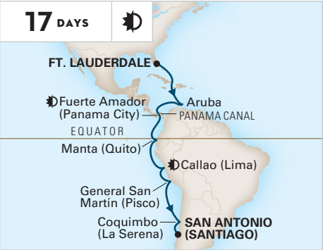
PANAMA CANAL & INCA DISCOVERY FT. LAUDERDALE TO SAN ANTONIO (SANTIAGO) Oosterdam 2023: Nov 15