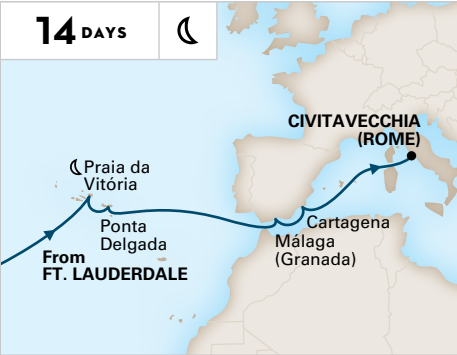
PASSAGE TO ROME FT. LAUDERDALE TO CIVITAVECCHIA (ROME) Oosterdam Apr 10