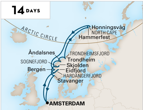
VOYAGE OF THE MIDNIGHT SUN ROUNTRIP AMSTERDAM Rotterdam Jul 1

Evening Stay. Departure between 10:00pm and Midnight. Extended Stay. Departure leaving the next calendar day.