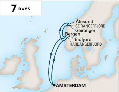
NORSE LEGENDS ROUNDTRIP AMSTERDAM Rotterdam Apr 29; May 20; Jun 17; Jul 15; Aug 12; Sep 9