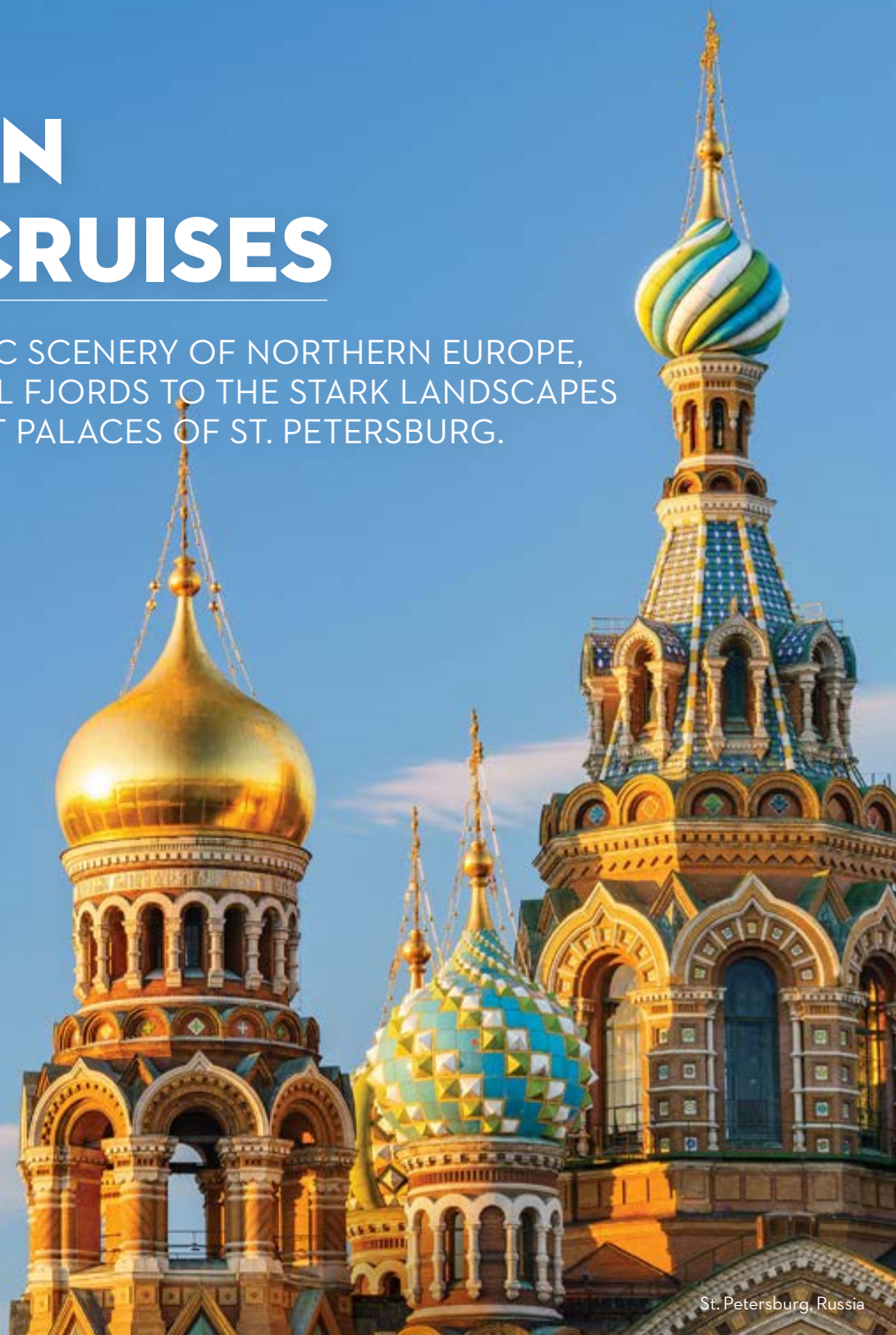
St. Petersburg, Russia

EXPERIENCE THE DRAMATIC SCENERY OF NORTHERN EUROPE, FROM NORWAY'S MYSTICAL FJORDS TO THE STARK LANDSCAPES OF ICELAND AND OPULENT PALACES OF ST. PETERSBURG.