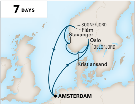
VIKING SAGAS ROUNDTRIP AMSTERDAM Rotterdam May 27; Jun 24; Jul 22; Aug 19; Sep 16