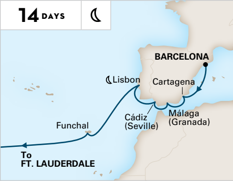
SPANISH FAREWELL BARCELONA TO FT. LAUDERDALE Oosterdam Nov 1