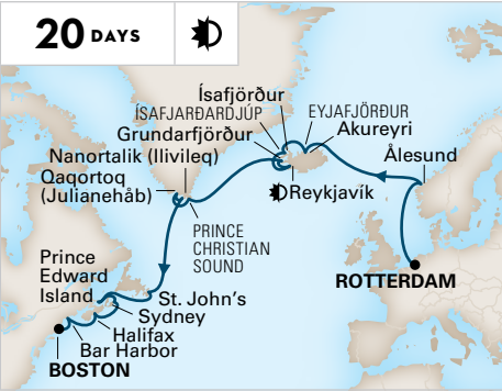
VIKING PASSAGE ROTTERDAM TO BOSTON Zuiderdam Jul 2