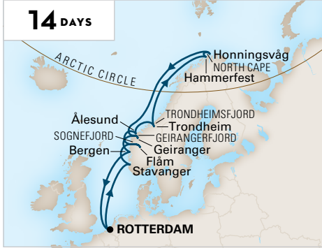
VOYAGE OF THE MIDNIGHT SUN ROUNTRIP ROTTERDAM Nieuw Statendam May 14