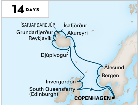
NORTHERN ISLES ROUNTRIP COPENHAGEN Nieuw Statendam Jun 18; Aug 23