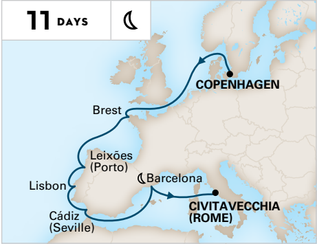
IBERIAN ADVENTURE COPENHAGEN TO CIVITAVECCHIA (ROME) Nieuw Statendam Sep 6