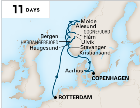
LEGENDS OF THE FJORDS ROTTERDAM TO COPENHAGEN Nieuw Statendam May 28