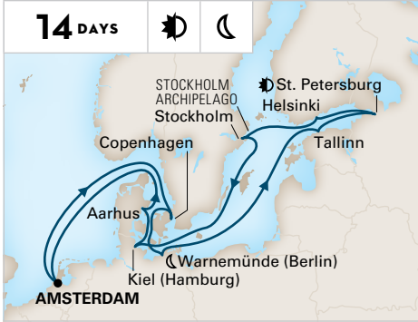
JEWELS OF THE BALTIC ROUNTRIP AMSTERDAM Rotterdam May 6; Jun 3; Sep 23