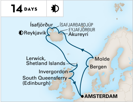
NORTHERN ISLES ROUNTRIP AMSTERDAM Rotterdam Jul 29; Aug 26