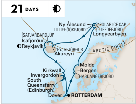
SPITSBERGEN & ICELANDIC FJORDS EXPLORER ROUNTRIP ROTTERDAM Zuiderdam Jun 11