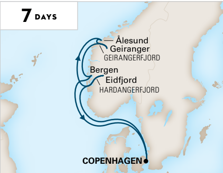
NORSE LEGENDS ROUNDTRIP COPENHAGEN Nieuw Statendam Jul 26