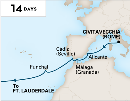
PASSAGE TO AMERICA CIVITAVECCHIA (ROME) TO FT. LAUDERDALE Nieuw Statendam Nov 5