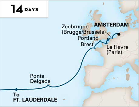
ATLANTIC SOJOURN AMSTERDAM TO FT. LAUDERDALE Rotterdam Oct 7