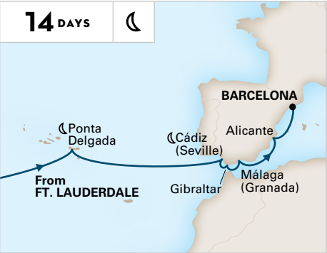
PASSAGE TO SPAIN FT. LAUDERDALE TO BARCELONA Nieuw Statendam Apr 8

These Collectors' Voyages combine two back-to-back itineraries to give you a more in-depth experience for an incredible value.