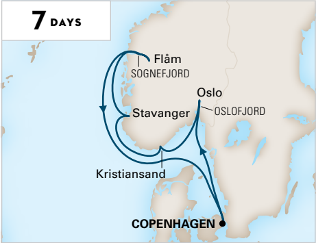
VIKING SAGAS ROUNTRIP COPENHAGEN Nieuw Statendam Aug 2