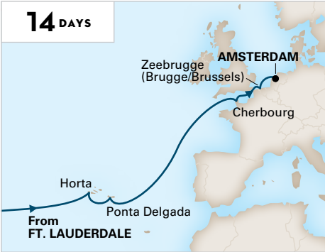
AZORES & NORMANDY EXPEDITION FT. LAUDERDALE TO AMSTERDAM Rotterdam Apr 15