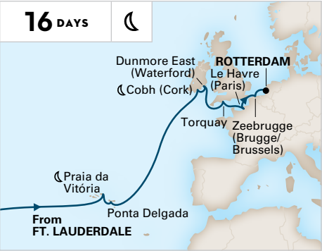
ATLANTIC SUNSETS & EXOTIC ISLES FT. LAUDERDALE TO ROTTERDAM Zuiderdam May 12