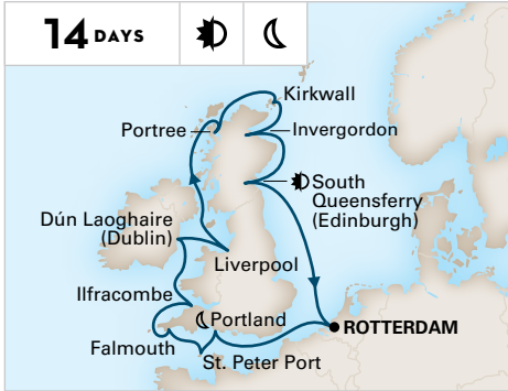
BRITISH ISLES ROUNTRIP ROTTERDAM Zuiderdam May 28