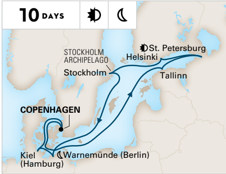
JEWELS OF THE BALTIC ROUNTRIP COPENHAGEN Nieuw Statendam Jun 8; Jul 2