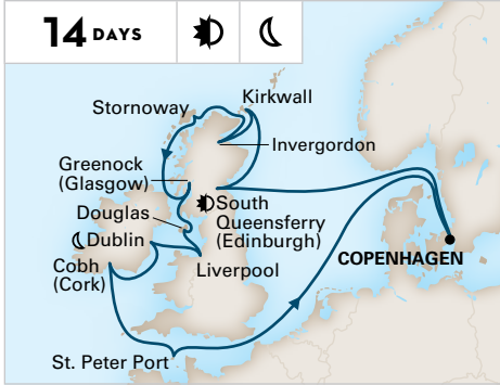
BRITISH ISLES ROUNTRIP COPENHAGEN Nieuw Statendam Aug 9