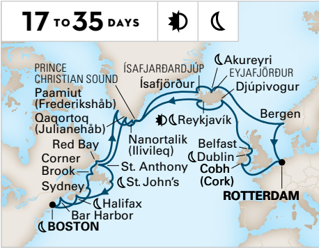
VOYAGE OF THE VIKINGS ROUNDTRIP BOSTON Zuiderdam Jul 22 35-Day Roundtrip Boston Jul 22 17-Day Boston to Rotterdam Aug 8 18-Day Rotterdam to Boston

Evening Stay. Departure between 10:00pm and Midnight. Extended Stay. Departure leaving the next calendar day.