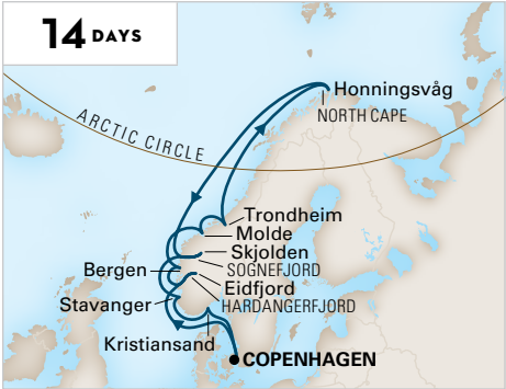
VOYAGE OF THE MIDNIGHT SUN ROUNTRIP COPENHAGEN Nieuw Statendam Jul 12