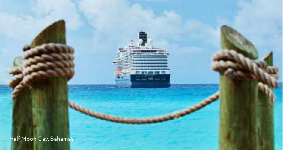
Half Moon Cay, Bahamas

Change to arrangements may be subject to change charges.