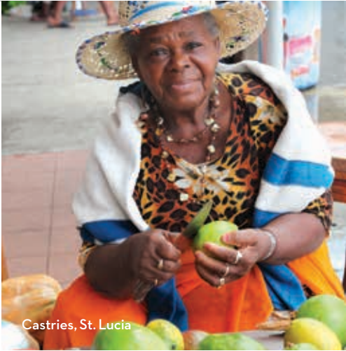
Castries, St. Lucia

Each of our ships is equipped with limited medical facilities that are staffed by a physician and registered nurses. Unless otherwise indicated in an active HAL policy (for example, the COVID-19 Protection Program), guest will be charged a fee for all medical services and medications obtained on board. If the onboard physician is unable to care for your needs on board, you will be transferred to medical facilities on shore. If your condition will require that you have special medical apparatus or assistance on board, we must be made aware of that at time of booking in order to determine whether we can accommodate your needs.