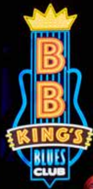
B. B. King's Blues Club