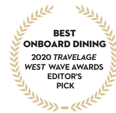
Grand Dutch Cafe