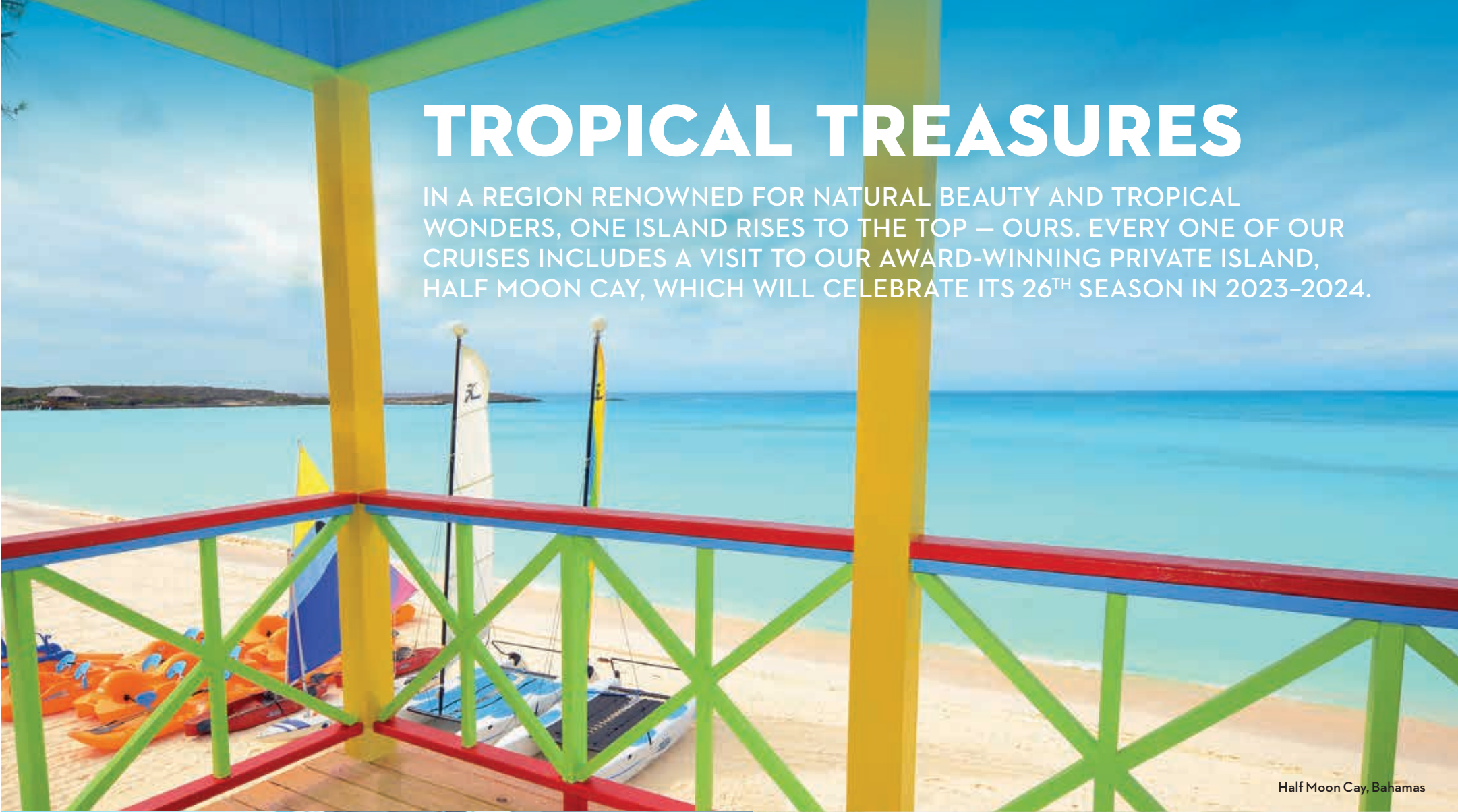
Half Moon Cay, Bahamas

IN A REGION RENOWNED FOR NATURAL BEAUTY AND TROPICAL WONDERS, ONE ISLAND RISES TO THE TOP – OURS. EVERY ONE OF OUR CRUISES INCLUDES A VISIT TO OUR AWARD-WINNING PRIVATE ISLAND, HALF MOON CAY, WHICH WILL CELEBRATE ITS 26 TH SEASON IN 2023-2024.