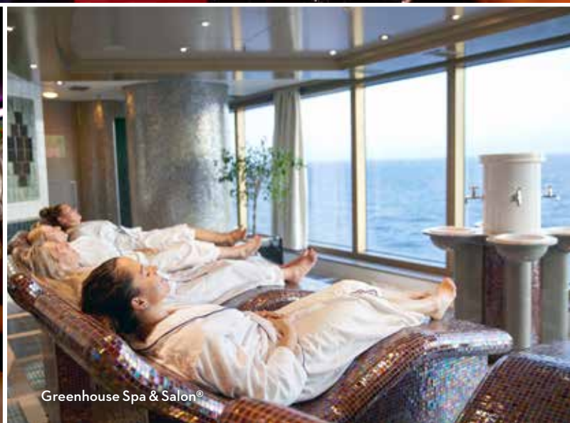
Greenhouse Spa &amp; Salon®