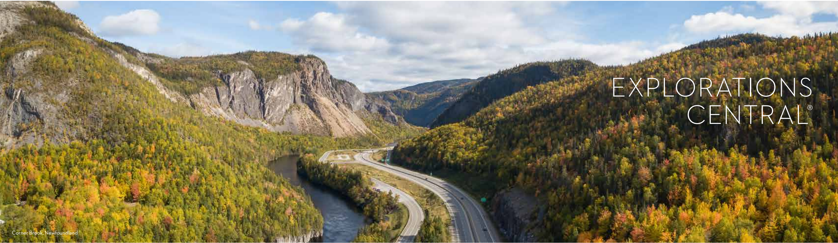
Corner Brook, Newfoundland

Go beyond the usual tourist track and experience amazing new places and cultures in an authentic way. Holland America Line’s exclusive Explorations Central destination programming is designed to deepen your understanding of the places you visit. Indispensable travel resources and opportunities to engage with our own experts, as well as local insiders, make exploring each port of call more vivid and meaningful.