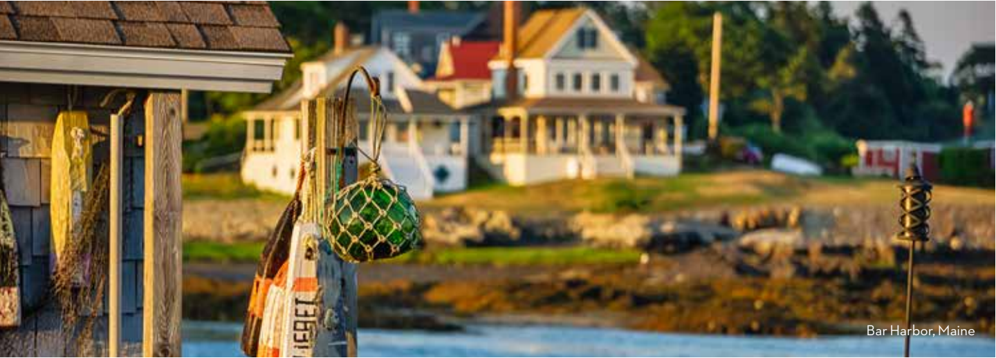
Bar Harbor, Maine

Each of our ships is equipped with limited medical facilities that are staffed by a physician and registered nurses. Unless otherwise indicated in an active HAL policy (for example, the COVID-19 Protection Program), guest will be charged a fee for all medical services and medications obtained on board. If the onboard physician is unable to care for your needs on board, you will be transferred to medical facilities on shore. If your condition will require that you have special medical apparatus or assistance on board, we must be made aware of that at time of booking in order to determine whether we can accommodate your needs.