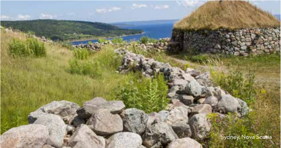
Sydney, Nova Scotia

Change to arrangements may be subject to change charges.